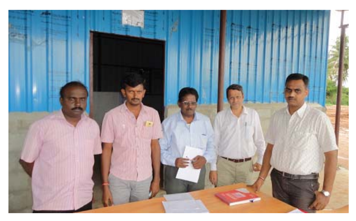
Photo 2: Meeting of the PSC with the RPP's Officials on June 28, 2016. At this meeting, the PSC explained the various safeguard issues with the Contractor