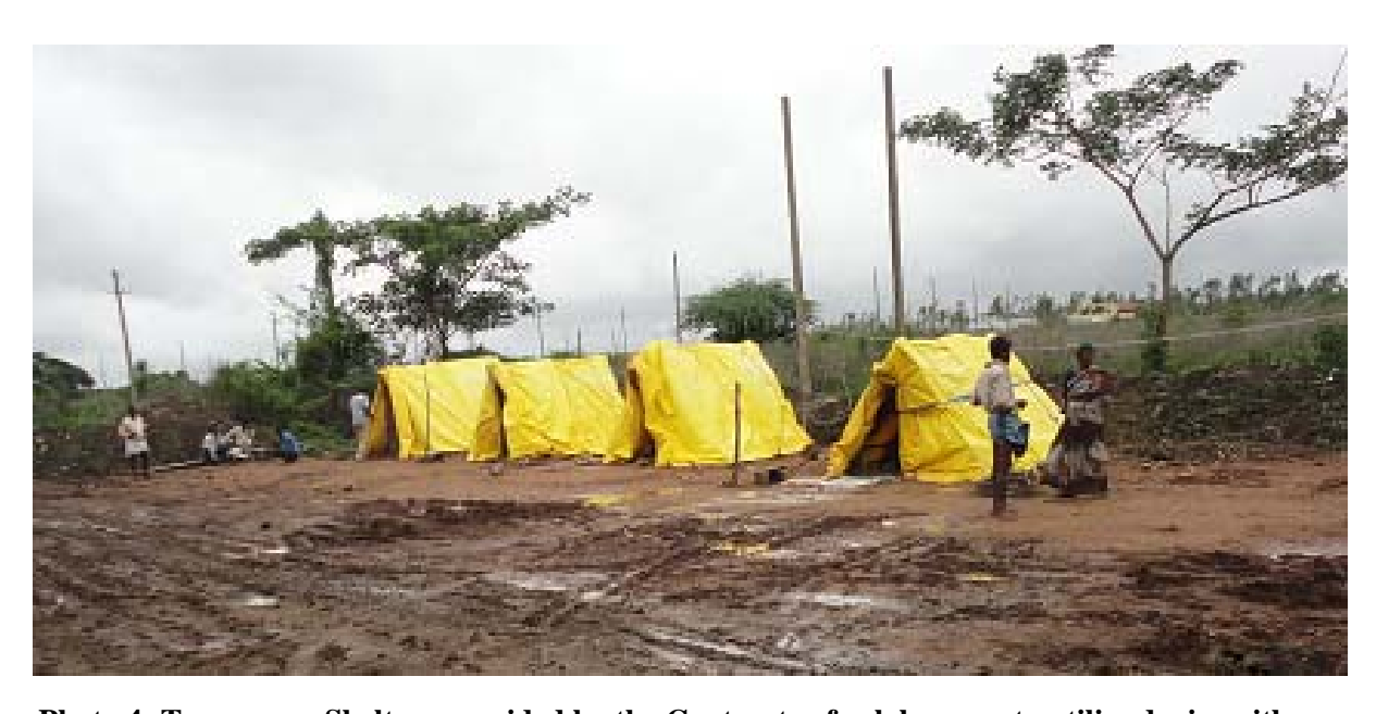
Photo 4: Temporary Shelters provided by the Contractor for labourers to utilise during either a break or temporary halt in construction triggered by natural events – Photographs taken on June 28, 2016