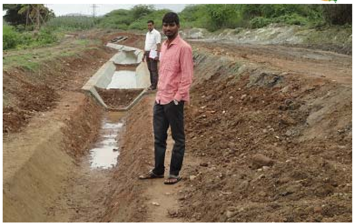
Photo 5: PSC Staff at the construction site to inspect the Silt Disposal Practices of the Contractor – Photograph taken on June 28, 2016