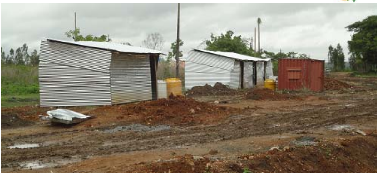
Photo 3: Make-shift Labourer's Quarters provided by the Contractor with Water and Sanitation Facilities