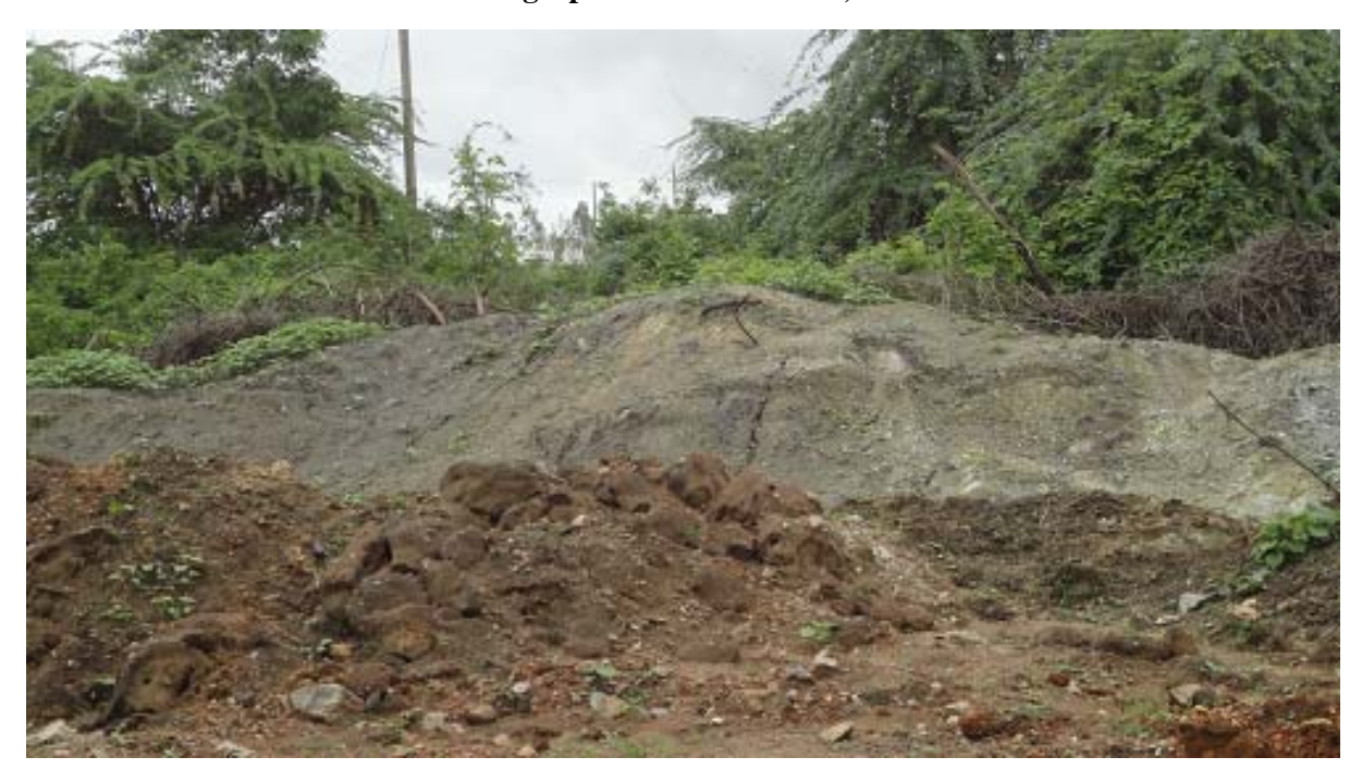
Photo 6: Close-up View of the Disposal of Silt as currently practised by the Contractor – Photograph taken on June 28, 2016